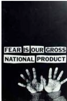
Image by Sheila Pinkel was shown in March 2005 in the "Fear Dust: Fallout of the Invasion" exhibit at Track 16 Gallery.

'Courage & Foresight' Conversation on Sat., 10/29 @ 1:30 PM