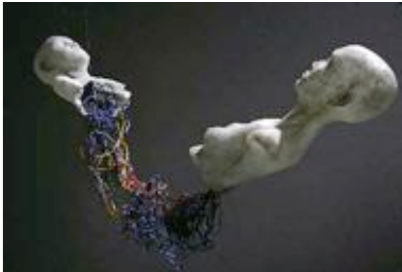
String Figures, 2002 by Hadiya Finley, figerglass.

Undermining the Hallmark perfection constructed in family albums and old home movies by carefully inserting texts that touch on the uncomfortable reality of divorce and