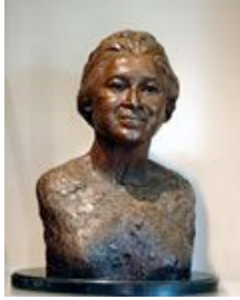
Rosa Parks sculpture by Artis Lane at the California African American Museum.

Join in the ART MATTERS potluck supper and lively discussion of current exhibitions and "Works By Women: From the Heart" video with interviews with ten women artists including Lynda Benglis. Shows to view in advance: "Body Double" (thru 10/13 - photography and video by 16 emerging female artists who use their own image) at Cal State L.A. Luckman Gallery and "A Woman's Journey: The Life and Work of Artis Lane" (thru 3/2/08) plus "Blacks In And Out of the Box" (thru 12/30) at the California African American Museum in Exposition Park.