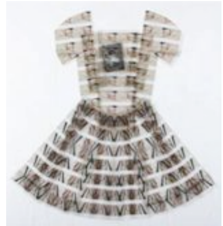
Women Artists on Immigration Opening